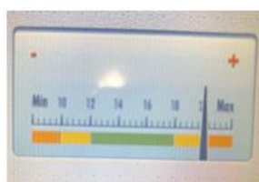
Pressure too high