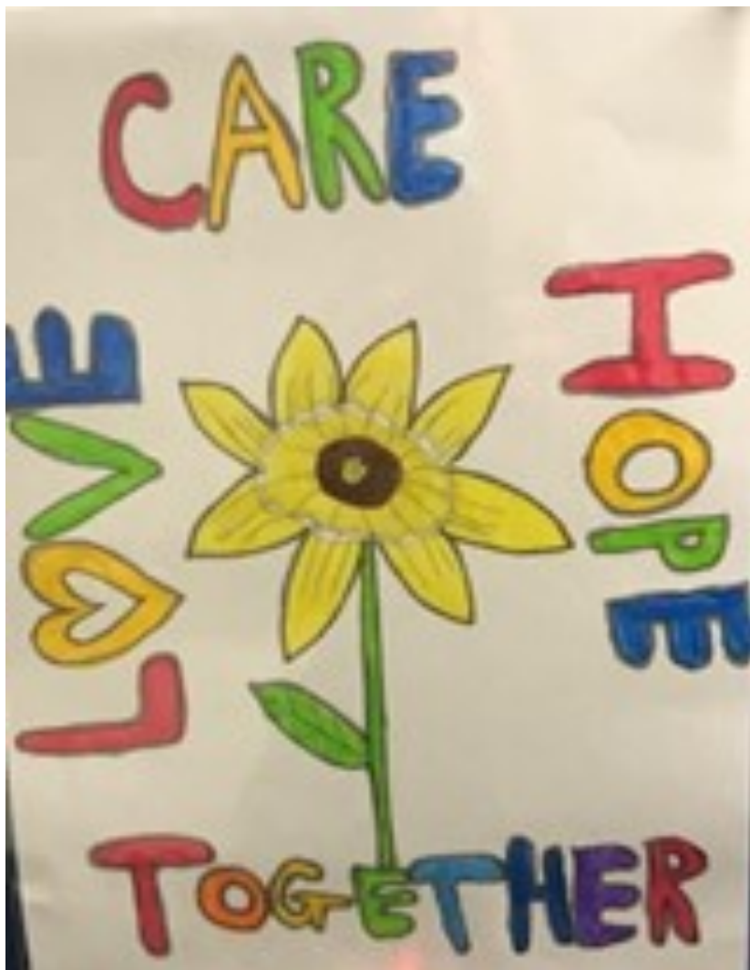
Art work displayed in Maternity UHNM Trust.