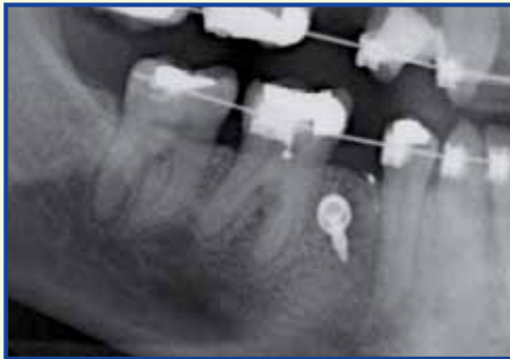
An X-ray showing a mini-screw placed between the lower teeth