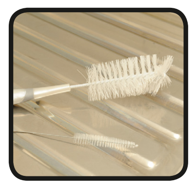
bottle brush, teat brush