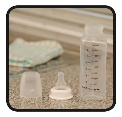
bottles with teats and bottle covers

You need to make sure you clean and sterilise the equipment to prevent your baby from getting infections and stomach upsets. You'll need: