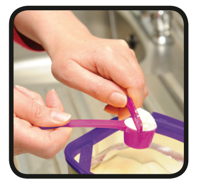
formula milk powder, or sterile ready-tofeed liquid formula