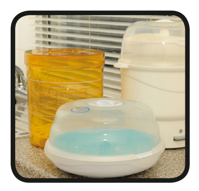
sterilising equipment (such as a cold-water steriliser, microwave or steam steriliser)