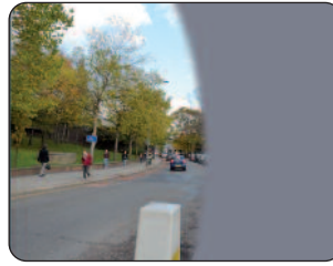
Right homonymous hemianopia

There are different types of visual field loss. The most common visual field loss following a stroke is a homonymous hemianopia. Hemianopia means loss of half of your vision. In other words the right half or the left half of your vision is missing from each eye.