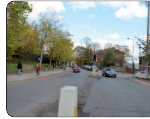
Normal field of vision

Other types of visual field loss seen following a stroke or head injury are: